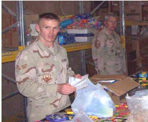
Soldier sorting supplies.