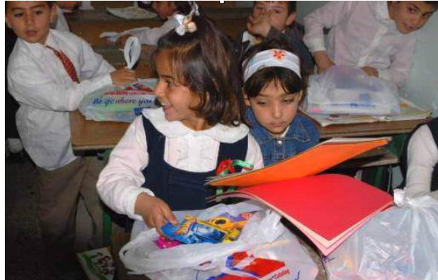
Kids of Kirkuk with school supplies.

Help the children of Iraq. Operation School Supplies is an outreach program supported by the men and women assigned to Kirkuk Regional Air Base and FOB WARRIOR. Our Soldiers, Sailors, Marines, Airmen, and civilian contractors communicated the needs to their families, friends and organizations back home. When the donations arrive, they are packaged and distributed to the needy school children of Iraq. We have recently been requested to assist several new schools in the Northern part of Iraq. Our efforts build strong, positive relationships across many generations of Iraqi families and your assistance is a partnership with us in building a brighter future for our friends here.